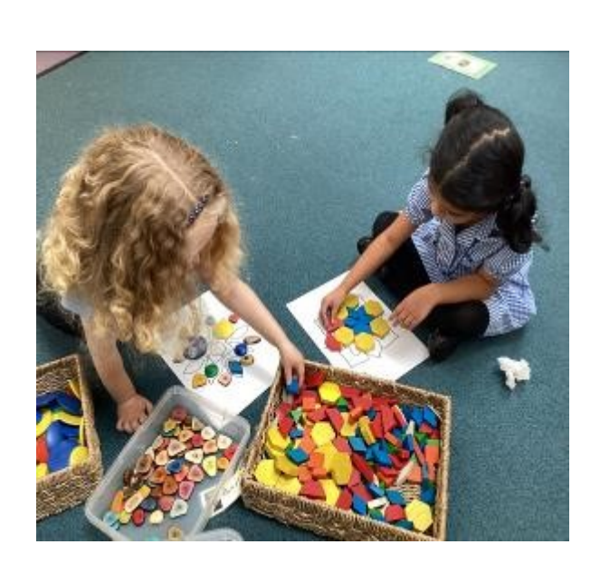
We have been celebrating Diwali. We even got to try some sweets!